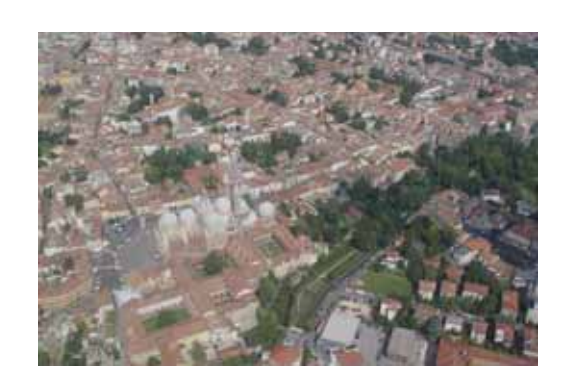
basilica di sant'antonio, padova