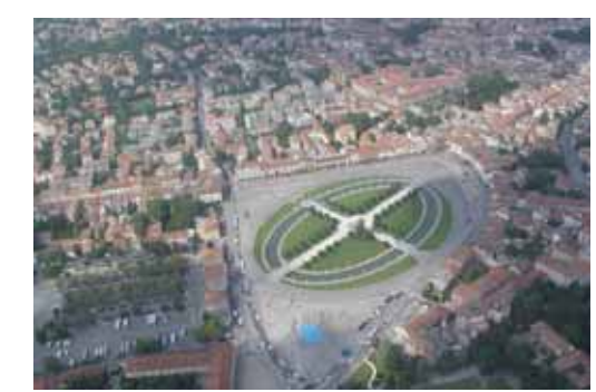
prato della valle, padova