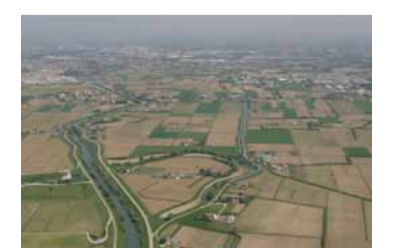
southern extent of study area