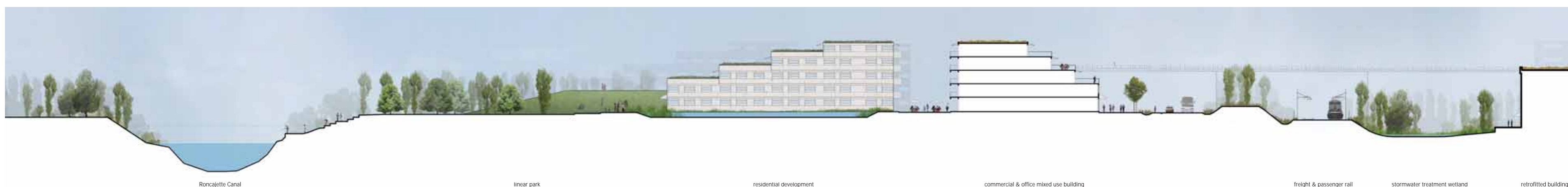
section 1: integration of park and development