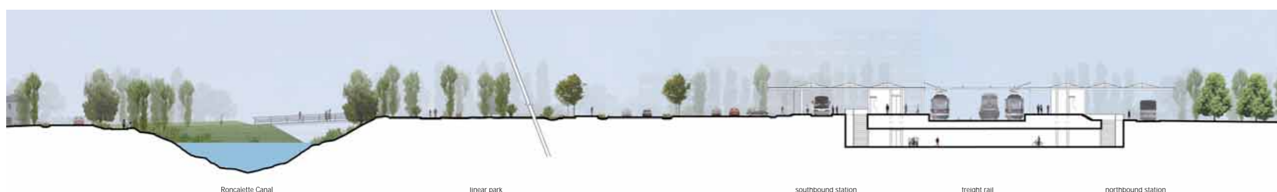
section 2: a new transit hub for bus and rail