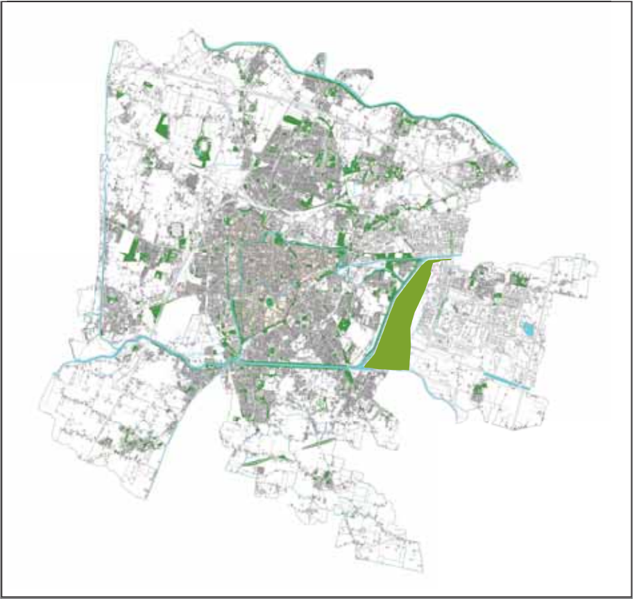
roncalette park: a development model for the future

Additionally, the redevelopment strategy of Roncajette Park could be a model for future park development elsewhere in the region, for which the Alliance could potentially expand its role. Thus Roncajette Park would become a catalyst for both an integrated city-wide park system and a broad regional park system.